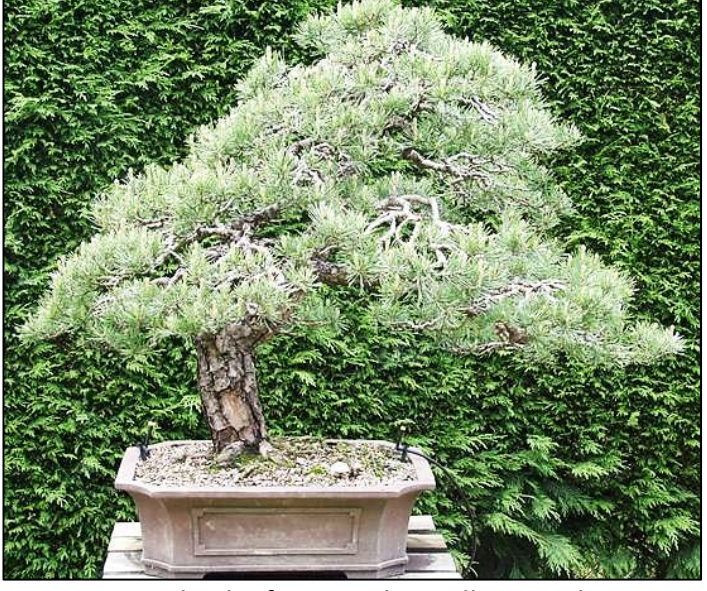
2005: tree showing extended low branch