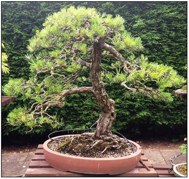
Appearance in 2018 showing trunk line and fore-shortened left low branch.

Since early 2018, the pine has now been placed in a Tokoname pot.